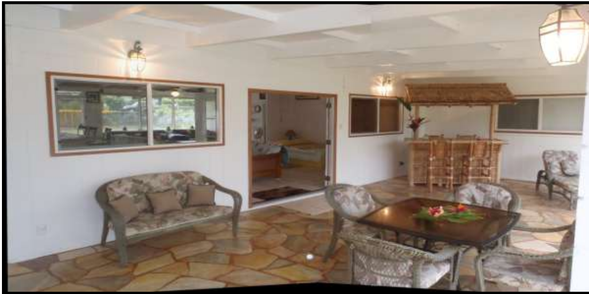
Covered Lanai and Tiki Bar