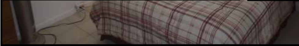
Front Corner Bedroom With Queen Bed