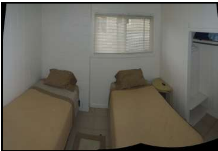
Kids room with Two Twin Beds