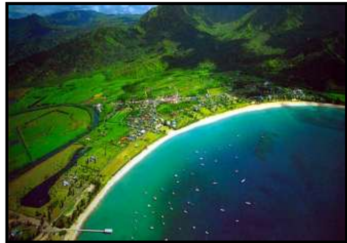
Hanalei Bay Shown Below

www.petritzrealty.com or markpetritz@gmail.com