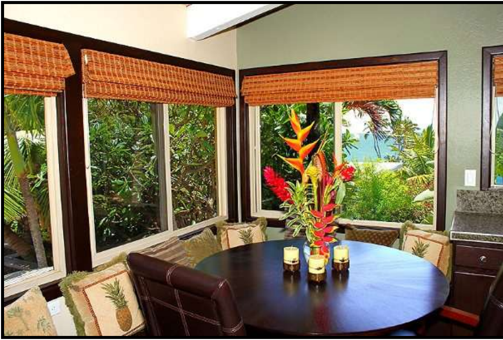
Ocean View Kitchen opens to the dining table and Kitchen Bar.