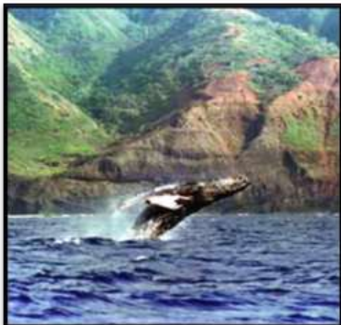
Whale Watching (Nov-Apr)