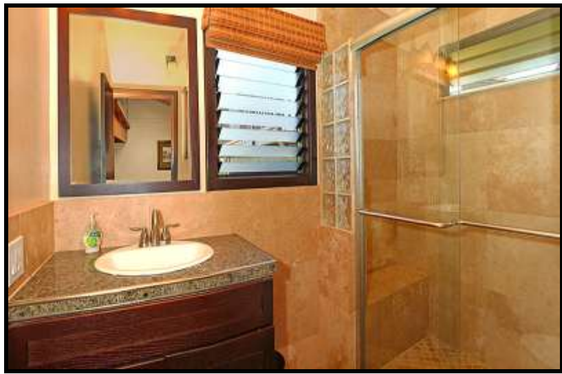
Master Suite with large walk in shower.