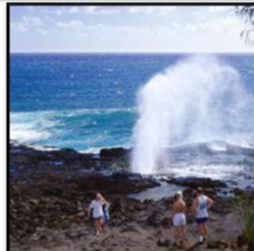
Blowhole near Poipu