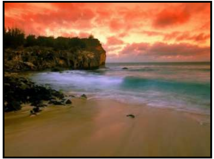
Shipwreck Beach Shown above (2 min drive away)