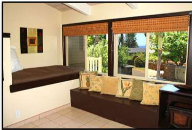
Twin bed sleeping nooks are perfect for kids.