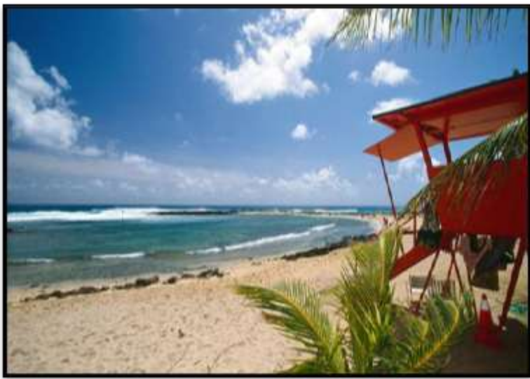
Poipu Beach Park Shown Above (short walk away)