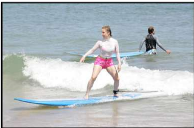
It's also a great spot to try Surfing or Stand Up Surfing