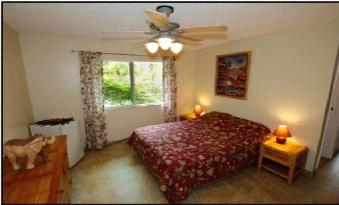
Suite #1 Shown at left and below.

Queen bed, AC, Refrigerator and Private Lanai that opens up to the back yard.