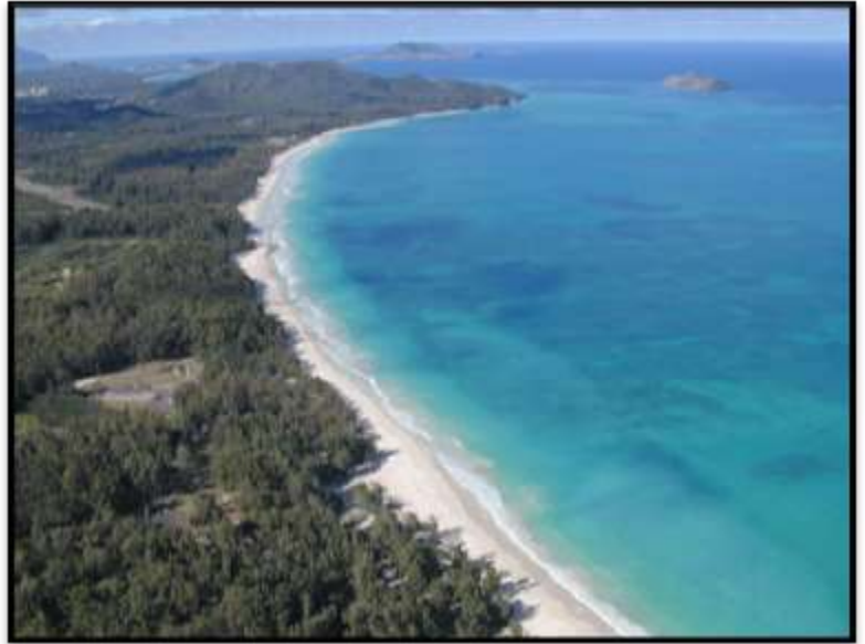
Stunning Aerial Shots of Waimanalo Beach