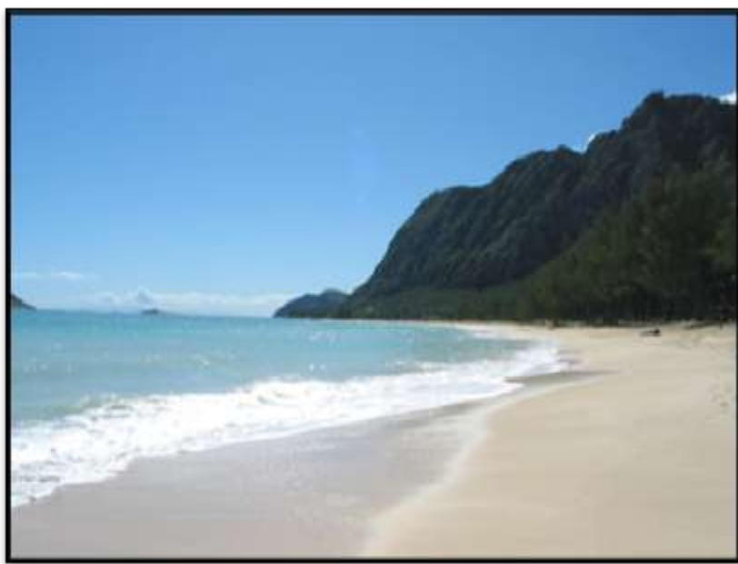
Views Waimanalo Beach to the Left and Right