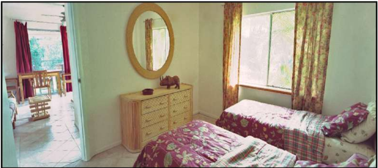
Ground Level Suite #4 Shown Above