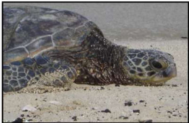
Endangered Seal and Turtle resting on the beach