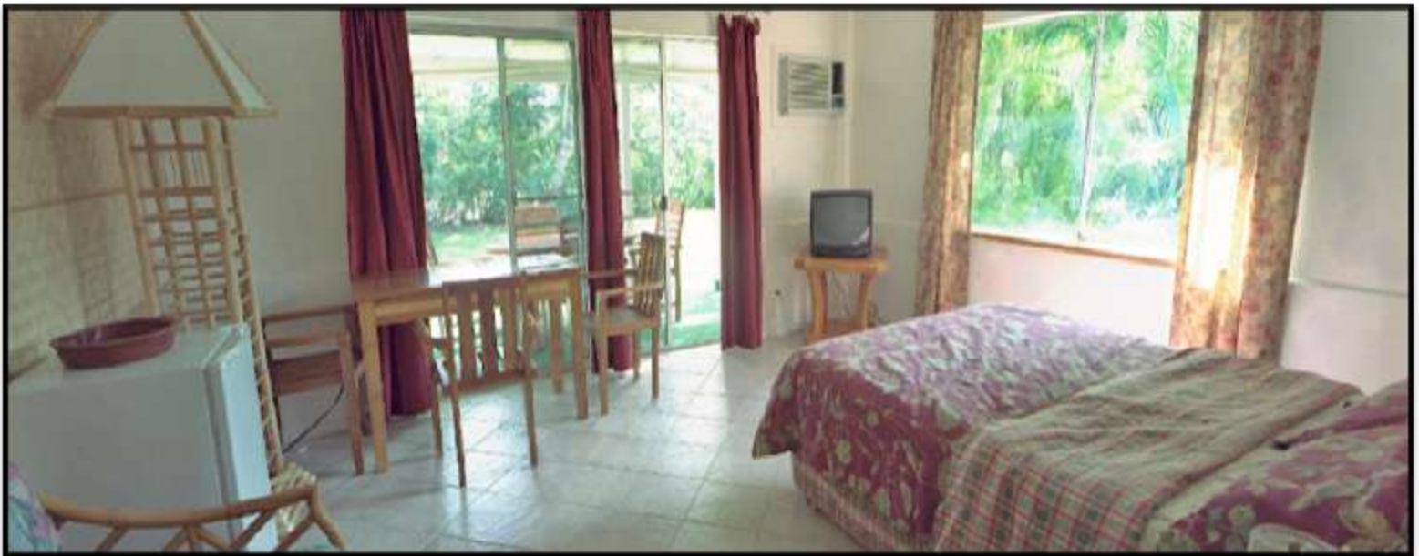
Suite #4 Shown Above.

Queen bed, AC, Refrigerator and Private Lanai that opens up to the back yard.